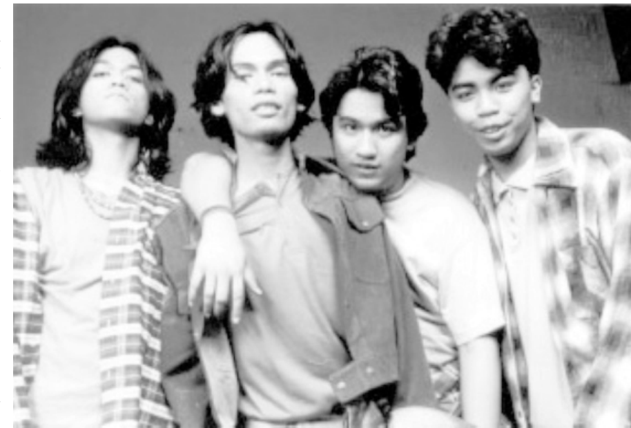
The Eraserheads, one of the most successful and influential Filipino rock bands in the '90s.